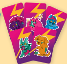
Zombie Puppy (back)